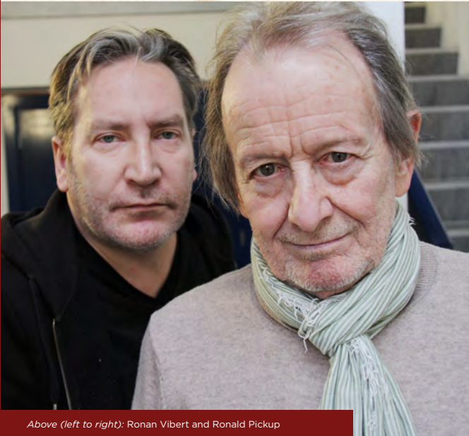
Above (left to right): Ronan Vibert and Ronald Pickup

"The brief was fairly open – it was even up to us whether we filled that gap with one story or two. In the end we thought that a two-parter stuck in the middle might