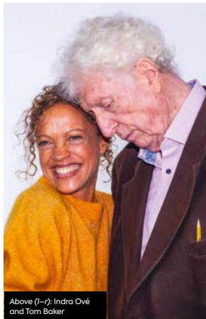
Above (l-r): Indra Ové and Tom Baker