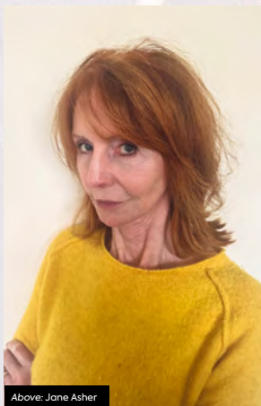
Above: Jane Asher

TARDIS travellers in particular. He says: “I love this gang. I love that the actors love this gang as well. I can see them travelling together for centuries to come! You can tell I adore characters when I get them all to sit down and have a meal. That’s the kind of scene that can subtly move the plot along, but really it’s just an excuse to have characterful moments in a domestic setting.