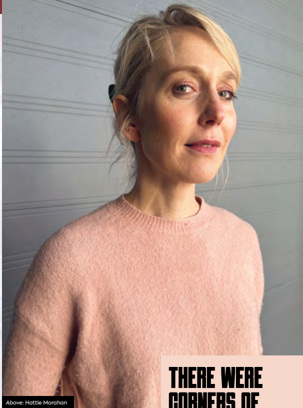
Above: Hattie Morahan

but as a man he's fairly unknown. A Cambridge don, unmarried, fastidious. He merges with the subjects of his stories, the scholar who looks too deeply into forbidden knowledge. But really he was quite a fun sort of chap. I love his book Eton & King's , which is a reflection on his school life and university career, you get a real sense of him as a person: an enthusiast, a traditionalist, but also a bit of a rebel, a questioner of ancient authorities. You get the sense that he and the Doctor would have been mates, and now they are!"