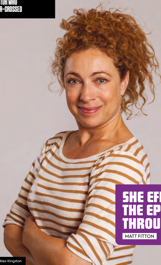
Above: Alex Kingston