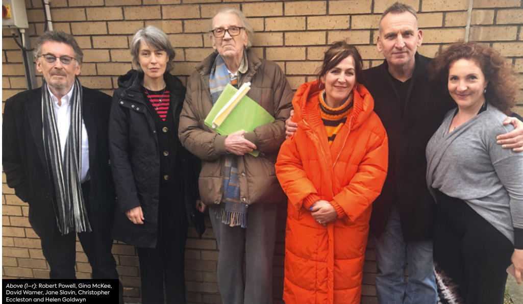
Above (l-r): Robert Powell, Gina McKee, David Warner, Jane Slavin, Christopher Eccleston and Helen Goldwyn

time. They've brought together the Doctors, Liv Chenka and the Lumiat in a timeless place where all time and no time converges. And here, they come into contact with a being called the Time Lord Immemorial..."