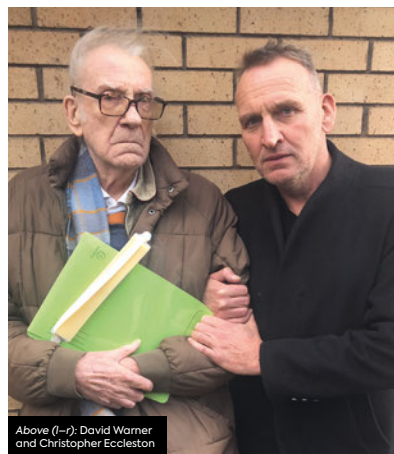
Above (l-r): David Warner and Christopher Eccleston