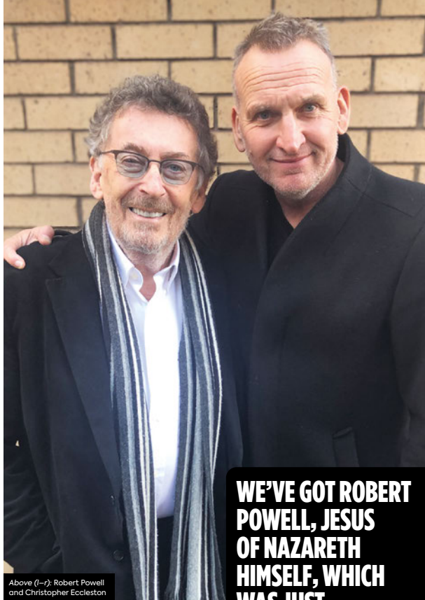
Above (l-r): Robert Powell and Christopher Eccleston

this universe under threat, but every universe is in danger, which brings him into contact with the Doctor from another reality.”