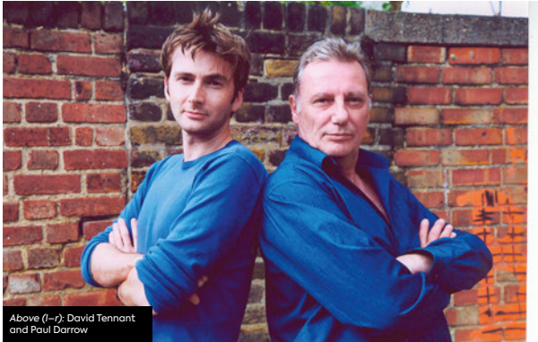
Above (l-r): David Tennant and Paul Darrow

David Tennant plays the leading man, adopts an English accent, says “Rose”, and travels between worlds. Yes, we’re talking about The Adventures of Luther Arkwright!