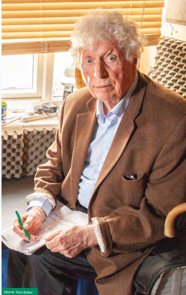
Above: Tom Baker

of making sure there was enough story, mystery and cliffhangers to sustain through its length. Hard work but great fun!