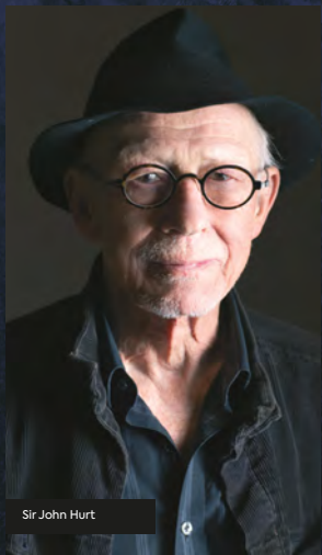
Sir John Hurt