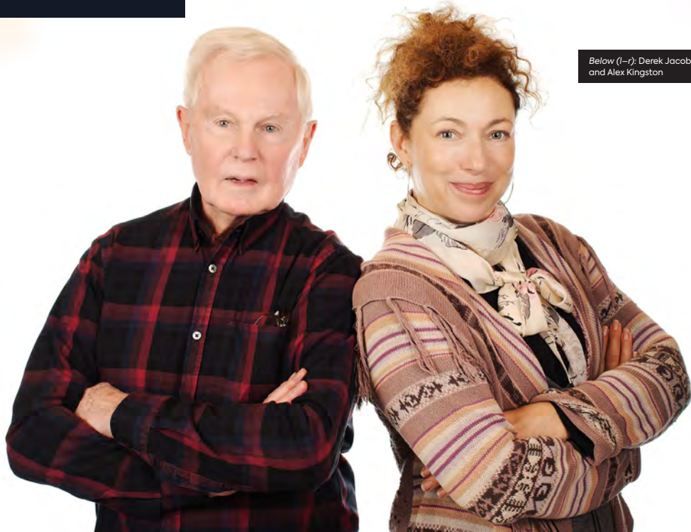
Below (l-r): Derek Jacobi and Alex Kingston