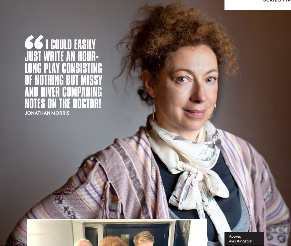
Above: Alex Kingston