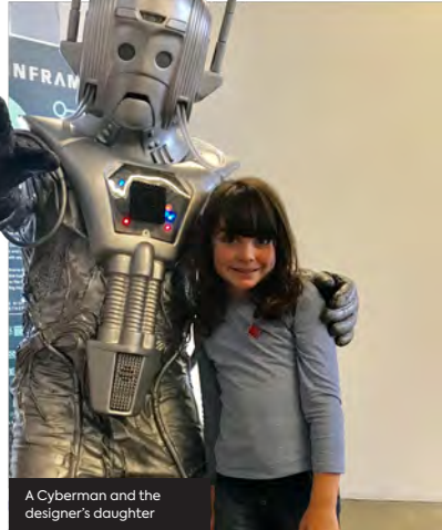
A Cyberman and the designer's daughter