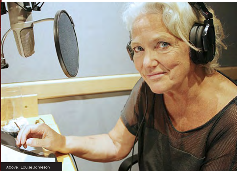
Above: Louise Jameson