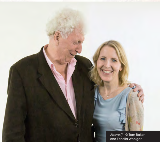
Above (l-r): Tom Baker and Fenella Woolgar