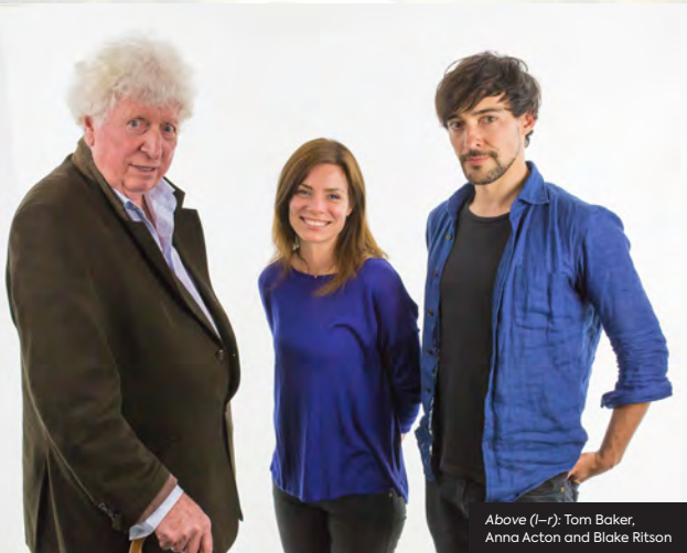
Above (l-r): Tom Baker, Anna Acton and Blake Ritson

far off the time I joined the police in 1984.