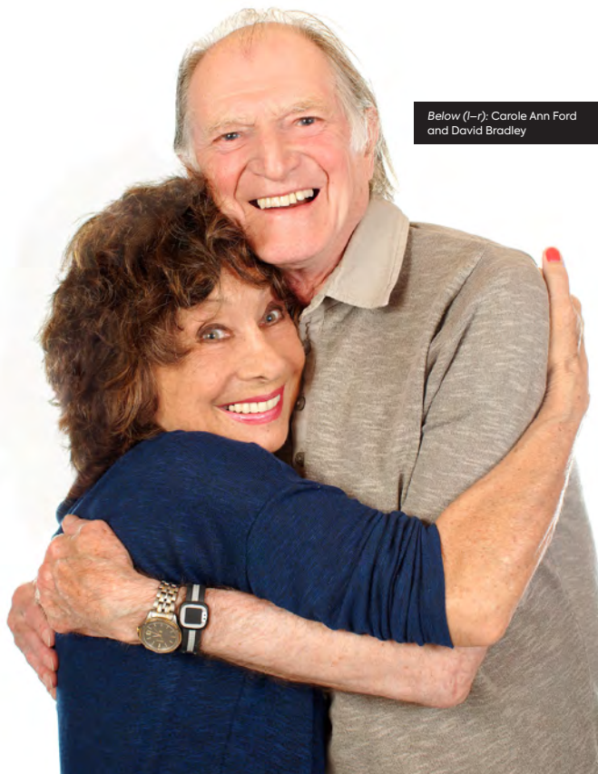
Below (l-r): Carole Ann Ford and David Bradley