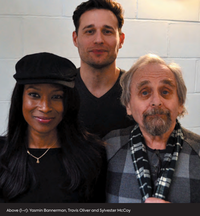
Above (l-r): Yasmin Bannerman, Travis Oliver and Sylvester McCoy

fact that Chris and Roz had a partnership before meeting the Doctor, so in a way, he becomes the outsider. A bit like Ian and Barbara back at the beginning. Even when the Doctor has several companions, they tend to only meet because of the Doctor, so he becomes the common factor, but having two strong personalities who have a shared history beyond that makes for a really interesting take on that dynamic."