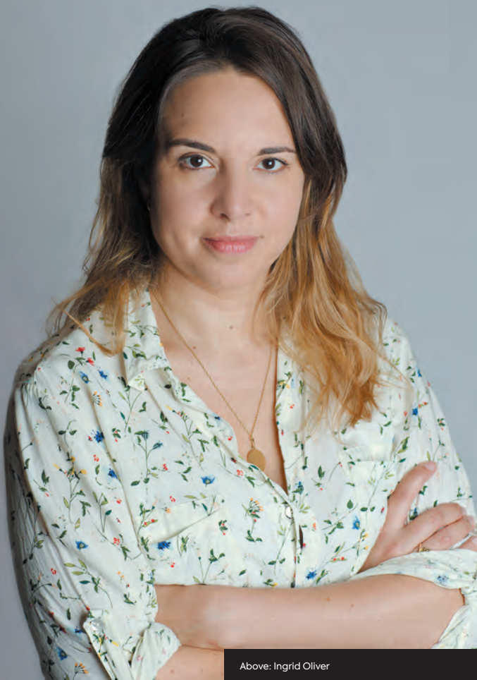
Above: Ingrid Oliver