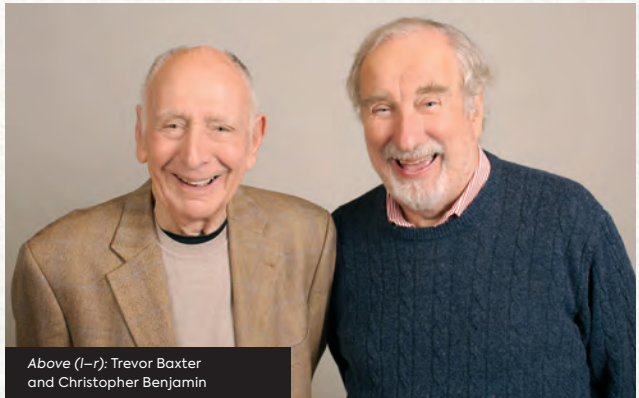
Above (l-r): Trevor Baxter and Christopher Benjamin

“The brief was to include Litefoot via a few flashbacks and, if possible, ‘in person’ in a limited capacity by using previously recorded dialogue in a new context. That was a real technical challenge, but there’s also an art to it; it was tricky to find things for the Professor to say that contributed to the plot without being too mundane. It involved a lot of research and trial and error; I enjoyed it, but then I’m odd like that...! Hopefully listeners will feel that the way George is