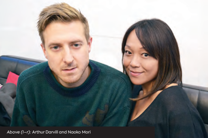
Above (l-r): Arthur Darvill and Naoko Mori