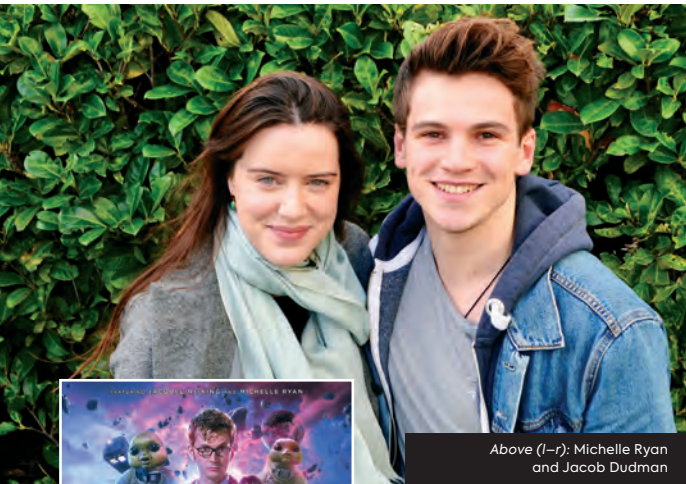
Above (l-r): Michelle Ryan and Jacob Dudman