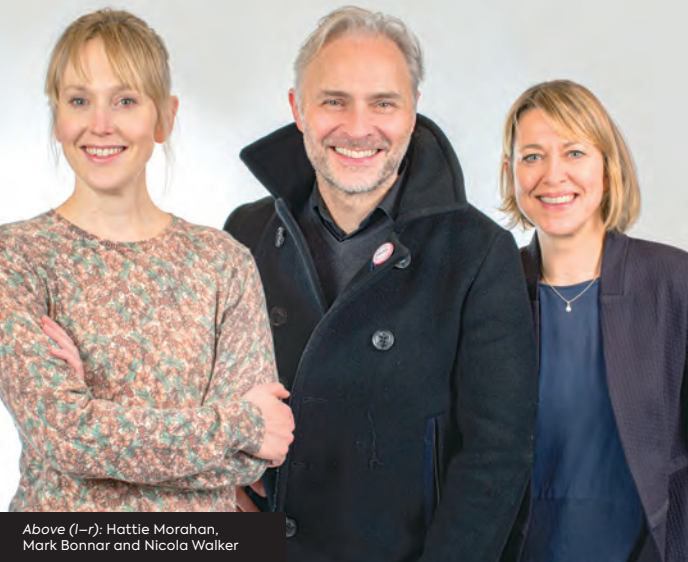
Above (l-r): Hattie Morahan, Mark Bonnar and Nicola Walker

secret that this picks up where Doom Coalition left off, but on the whole this new series is going to be very different in tone.”