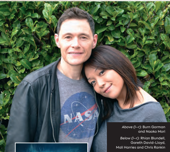
Above (l-r): Burn Gorman and Naoko Mori