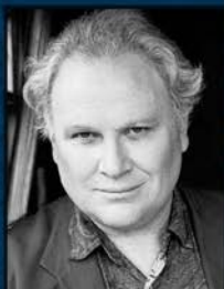
6 th Doctor COLIN BAKER