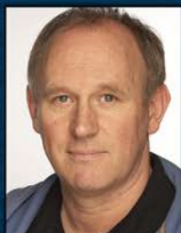
5 th Doctor PETER DAVISON