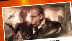
THE CHURCHILL YEARS VOLUME TWO