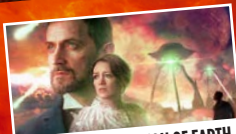
THE MARTIAN INVASION OF EARTH IT'S WAR IN THE FINAL HG WELLS RELEASE