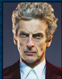
12 th Doctor PETER CAPALDI