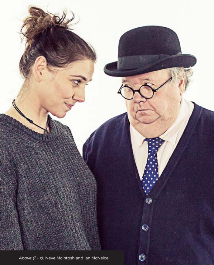
Above (l - r): Neve McIntosh and Ian McNeice

i.e. in which the Nazis won, are pretty naff, let's be honest. Except I suddenly thought – what about a parallel world in which Imperial Germany won WWII...? And that was the lightbulb moment, I guess!"