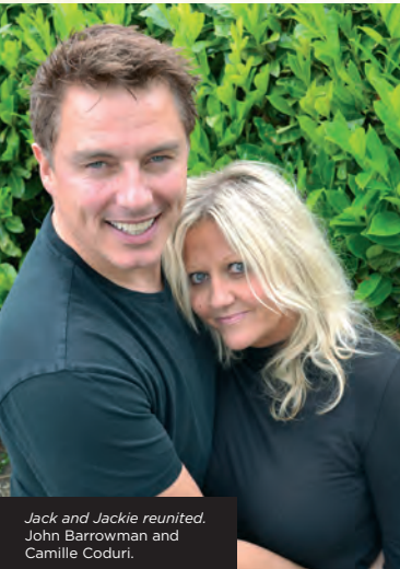
Jack and Jackie reunited. John Barrowman and Camille Coduri.