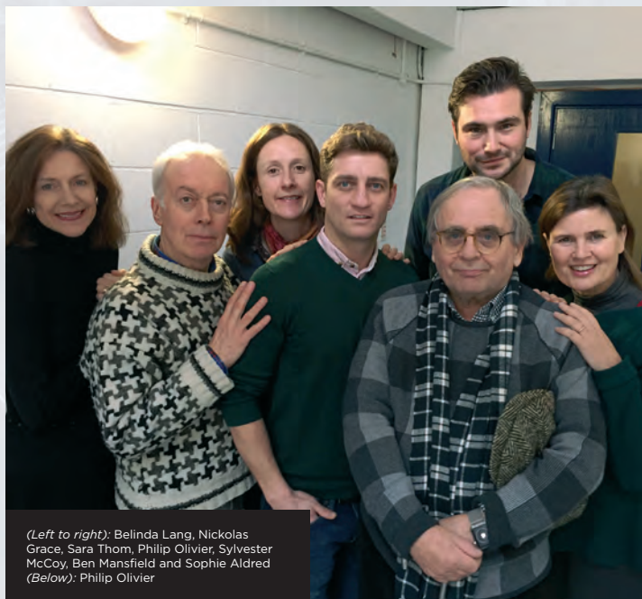
(Left to right): Belinda Lang, Nickolas Grace, Sara Thom, Philip Olivier, Sylvester McCoy, Ben Mansfield and Sophie Aldred (Below): Philip Olivier

“All I’m thinking of is securing the future of my family, so when