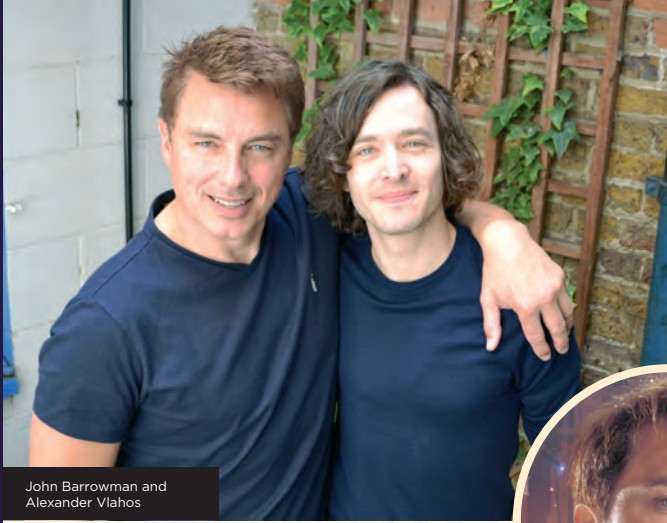
John Barrowman and Alexander Vlahos