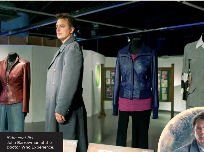
If the coat fits... John Barrowman at the Doctor Who Experience.