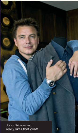
John Barrowman really likes that coat!

no stranger to the world of radio drama. It was a very easy recording session. He also brought his French Bulldog Rocky along for the ride, which immediately meant I never wanted the recording to end!"